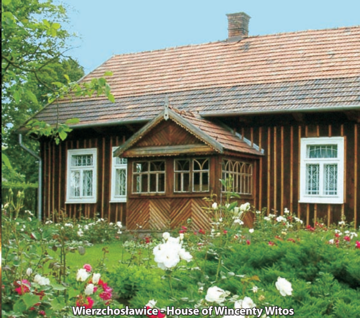
Wierchosławice - House of Wincenty Witos