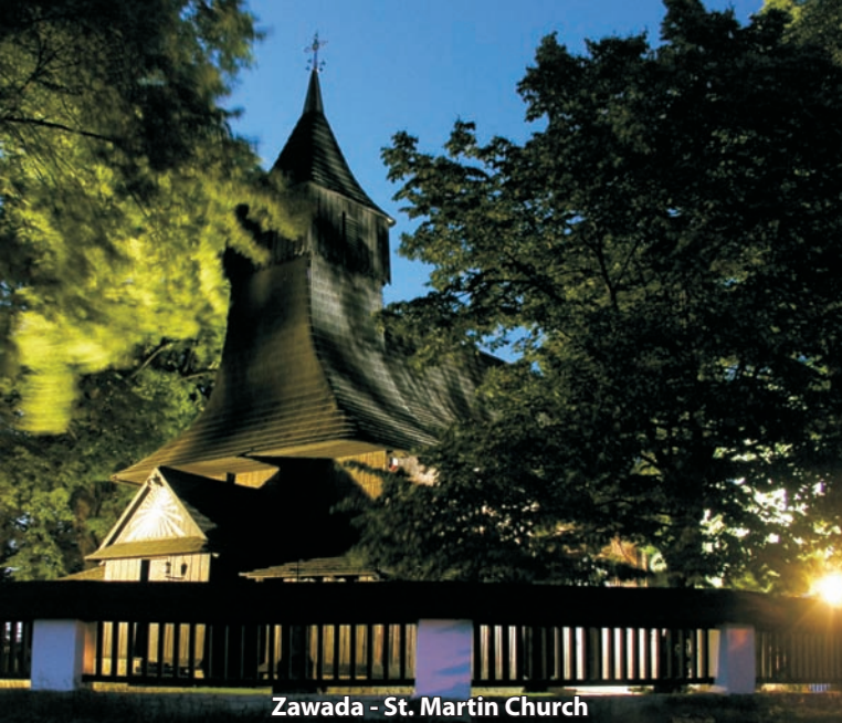
Zawada - St. Martin Church