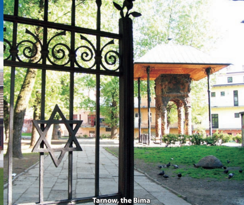
Tarnów, the Bima