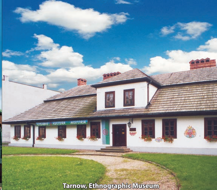
Tarnów, Ethnographic Museum