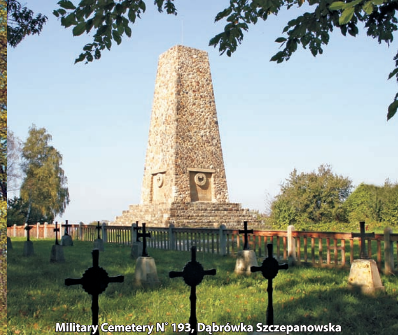
Military Cemetery N° 193, Dąbrówka Szczepanowska