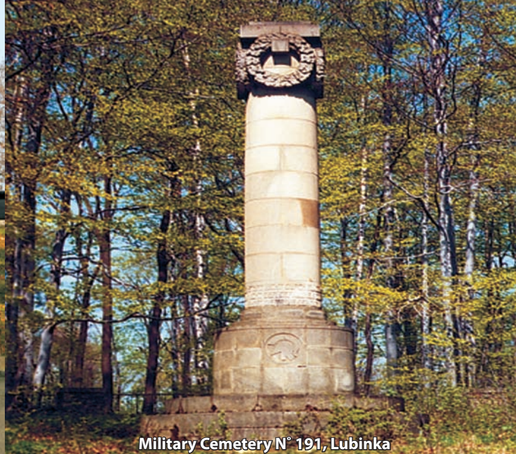
Military Cemetery N° 191, Lubinka