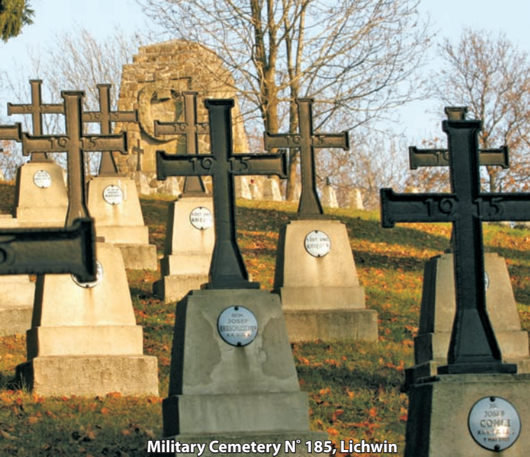
Military Cemetery N° 185, Lichwin