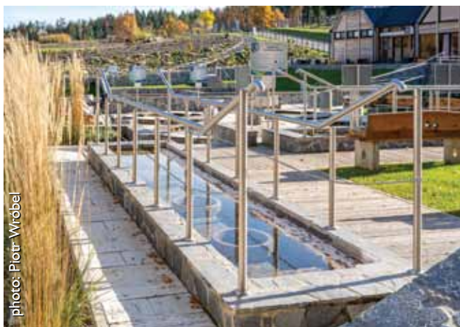
Spa Park in Ciężkowice