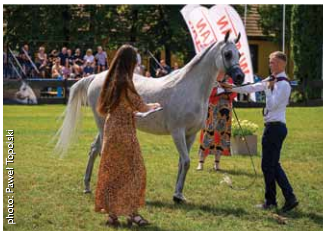
All Polish Arabian Horse Championship in Tarnów – Klikowa