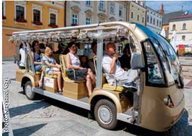
Sightseeing Tarnów by Enobus