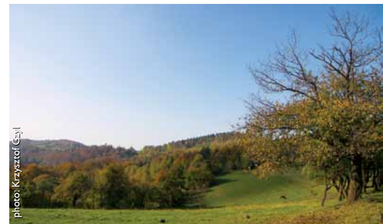
Ciężkowicko-Rożnowski Landscape Park