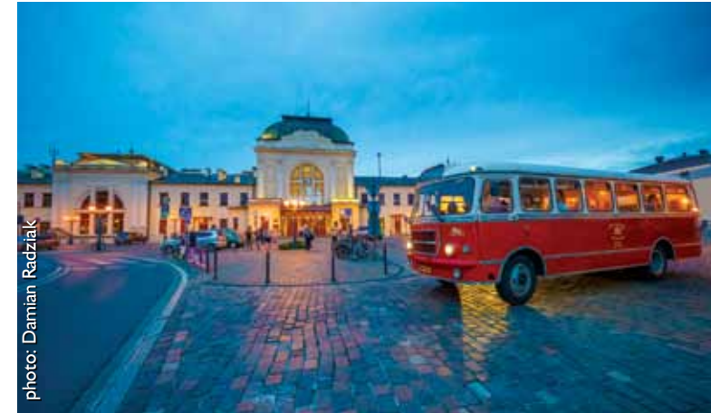
Historic bus in front of Tarnów railway station