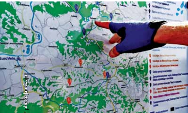
On the Spring Trail