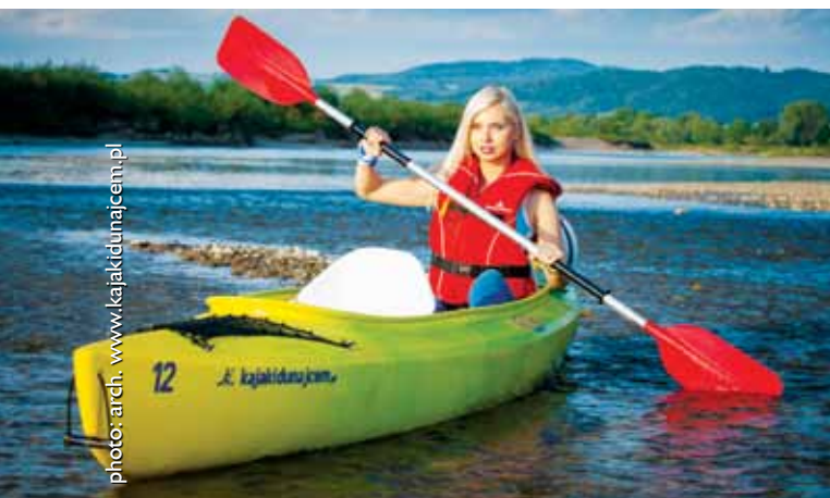
Kayaking on the Dunajec River