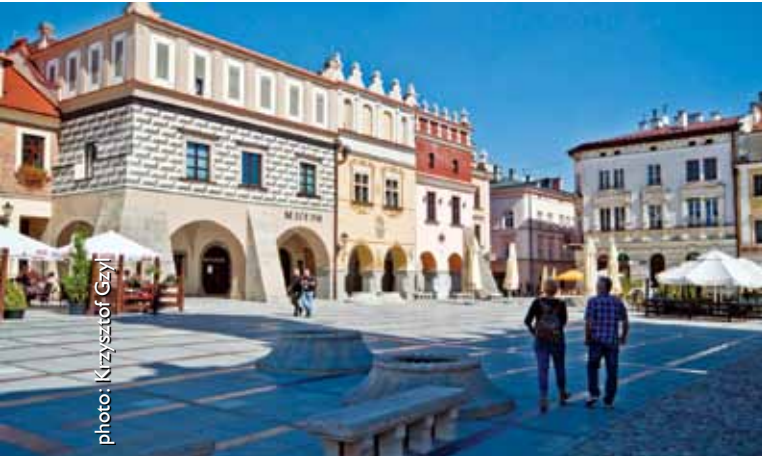
Renaissance townhouses on the market square in Tarnów